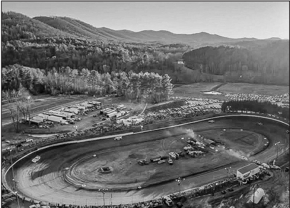
Tri-County Racetrack is gearing up for another season of racing.